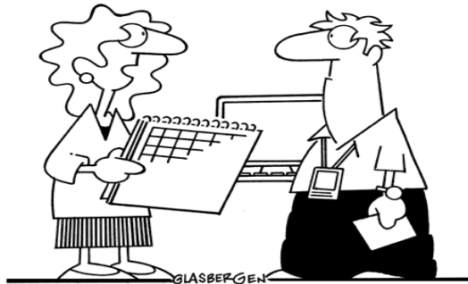
"This calendar has 11 days a week, 9 weeks a month, and 17 months a year. I bought it at the Time Management Seminar!"